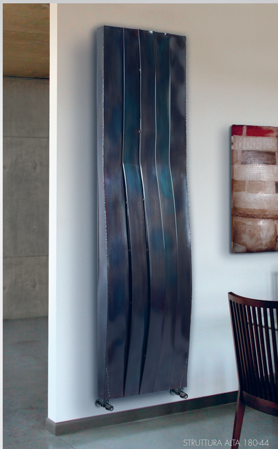
STRUTTURA ALTA 180-44

EN 442 Watt Δt 50K (Δt 40K = Wx0,755) - (Δt 30K = Wx0,526)