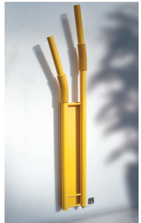
HEATING ELEMENT POSITION © Vertical Electric Heating Element