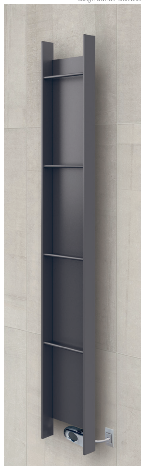
HEATING ELEMENT POSITION © Vertical Electric Heating Element