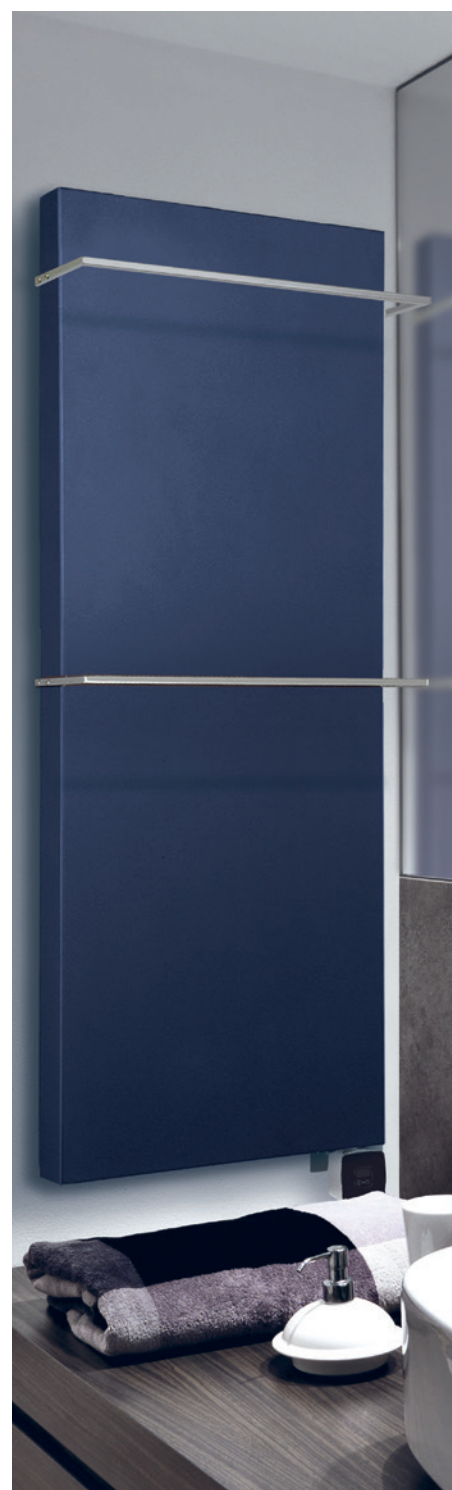
HEATING ELEMENT POSITION © Vertical Electric Heating Element