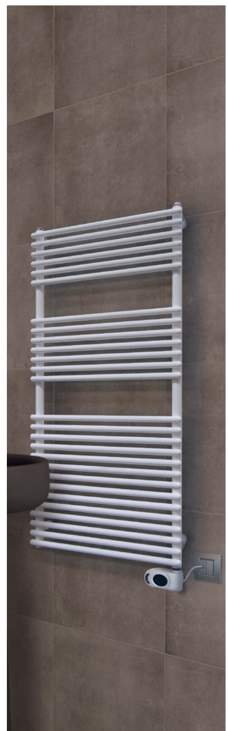
HEATING ELEMENT POSITION © Vertical Heating Element