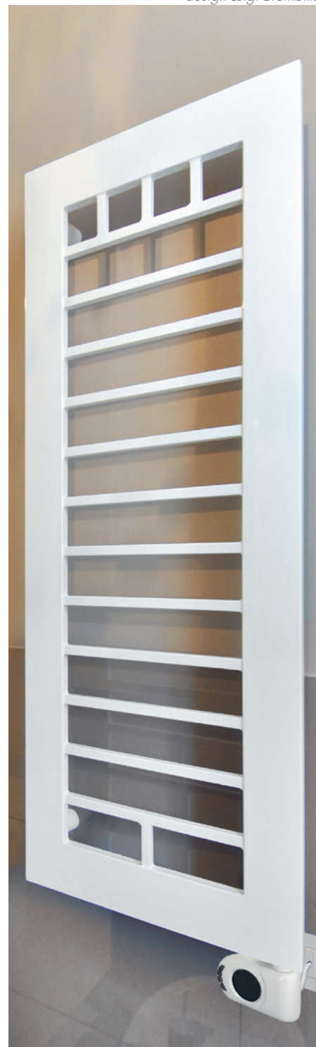
HEATING ELEMENT POSITION © Vertical Heating Element