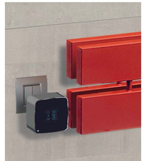
HEATING ELEMENT POSITION ©Horizontal Heating Element